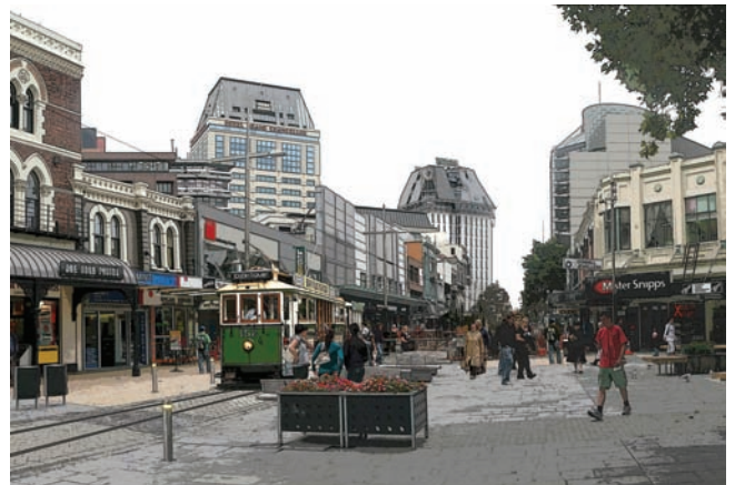
An artist's impression of a tram running on the extended route through City Mall.

Council staff have recently been working on the High Street Upgrade project (between Cashel and Lichfield streets) which is a full street upgrade. As well as tram tracks, the project includes widening the existing kerbs, changing the parking layout and new street furniture. Consultation on the proposed plan closed in November and the findings will be presented to the Council in February. If approved, the work will be included in the tram extension contract.